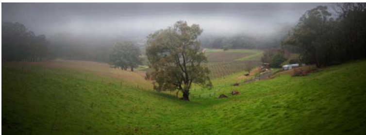
Winter Solitude 2 shows a foggy winter landscape, complete with dewy grass and vines in the background